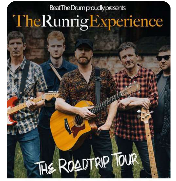
The Nevis Centre // Fort William 31/10/24 // 7.30pm // Tickets £22.50